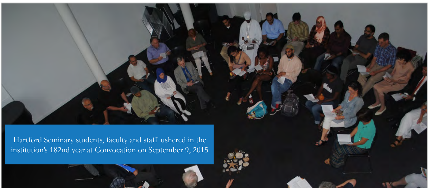
Hartford Seminary students, faculty and staff ushered in the institution's 182nd year at Convocation on September 9, 2015